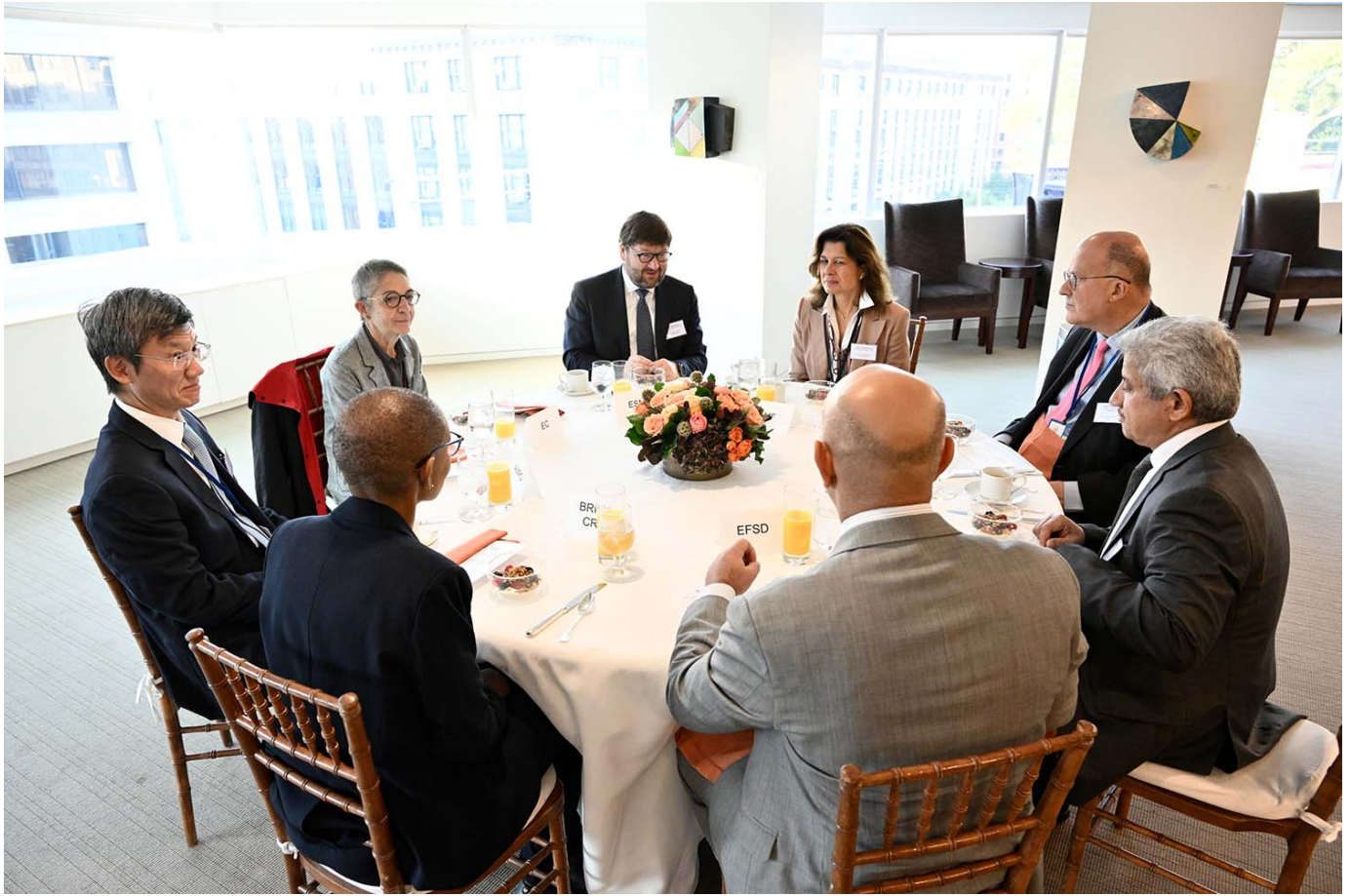
7th High-level RFA Dialogue