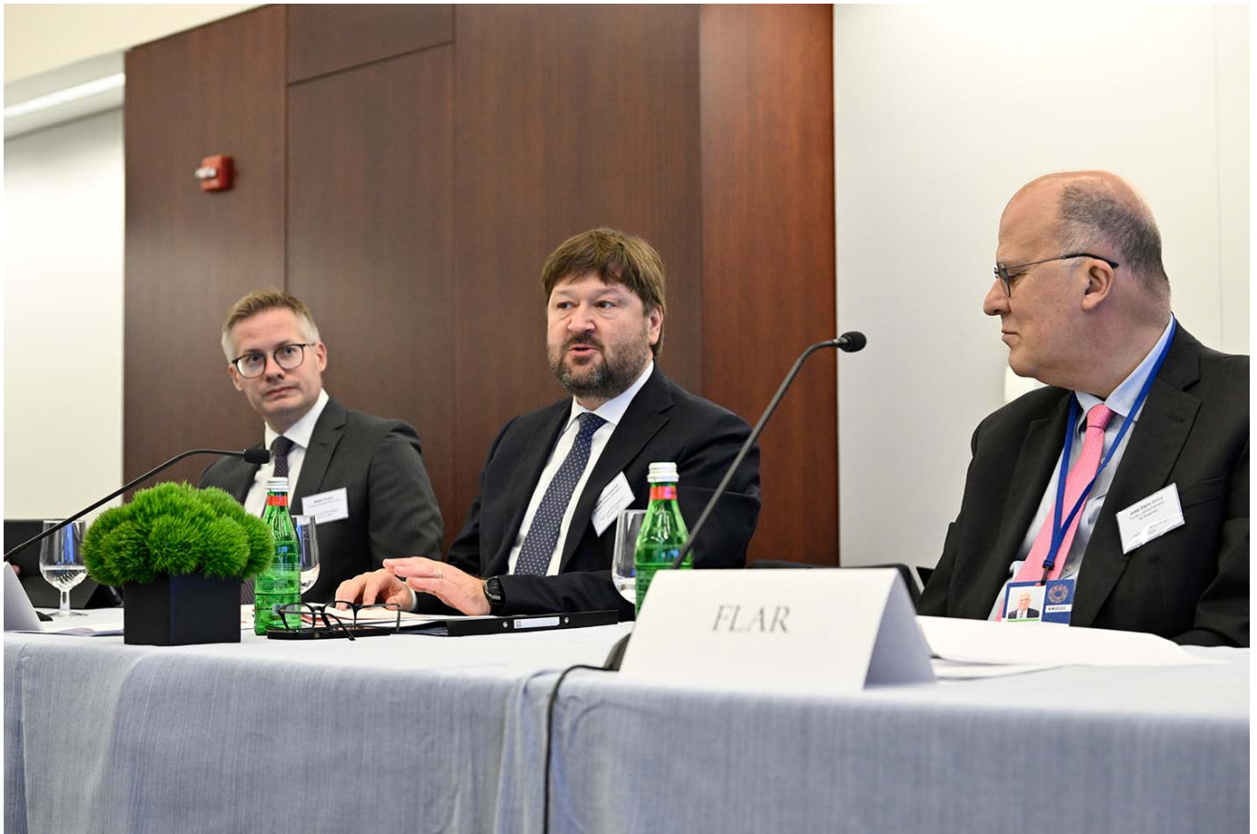
7th High-level RFA Dialogue