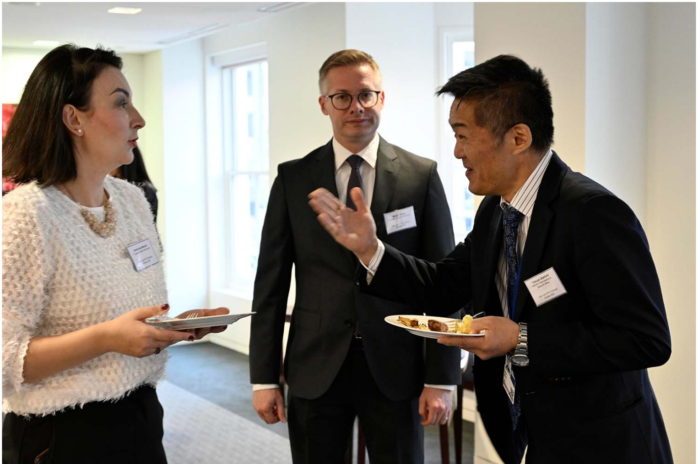
7th High-level RFA Dialogue