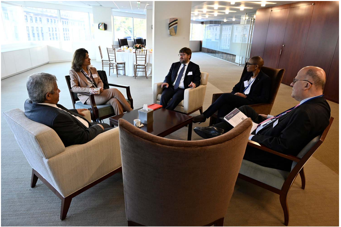
7th High-level RFA Dialogue