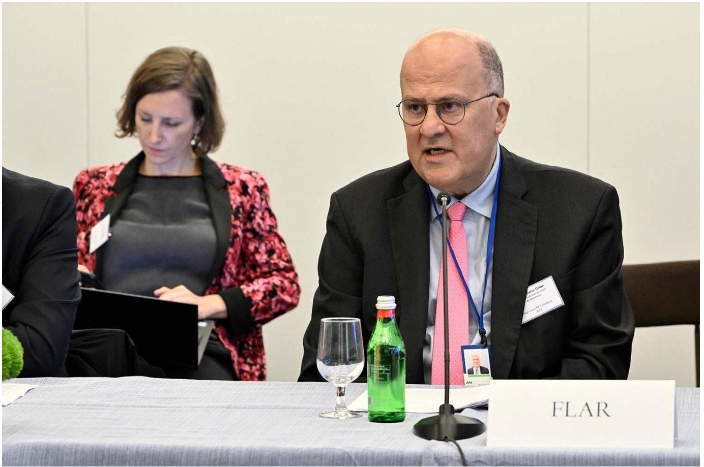
7th High-level RFA Dialogue