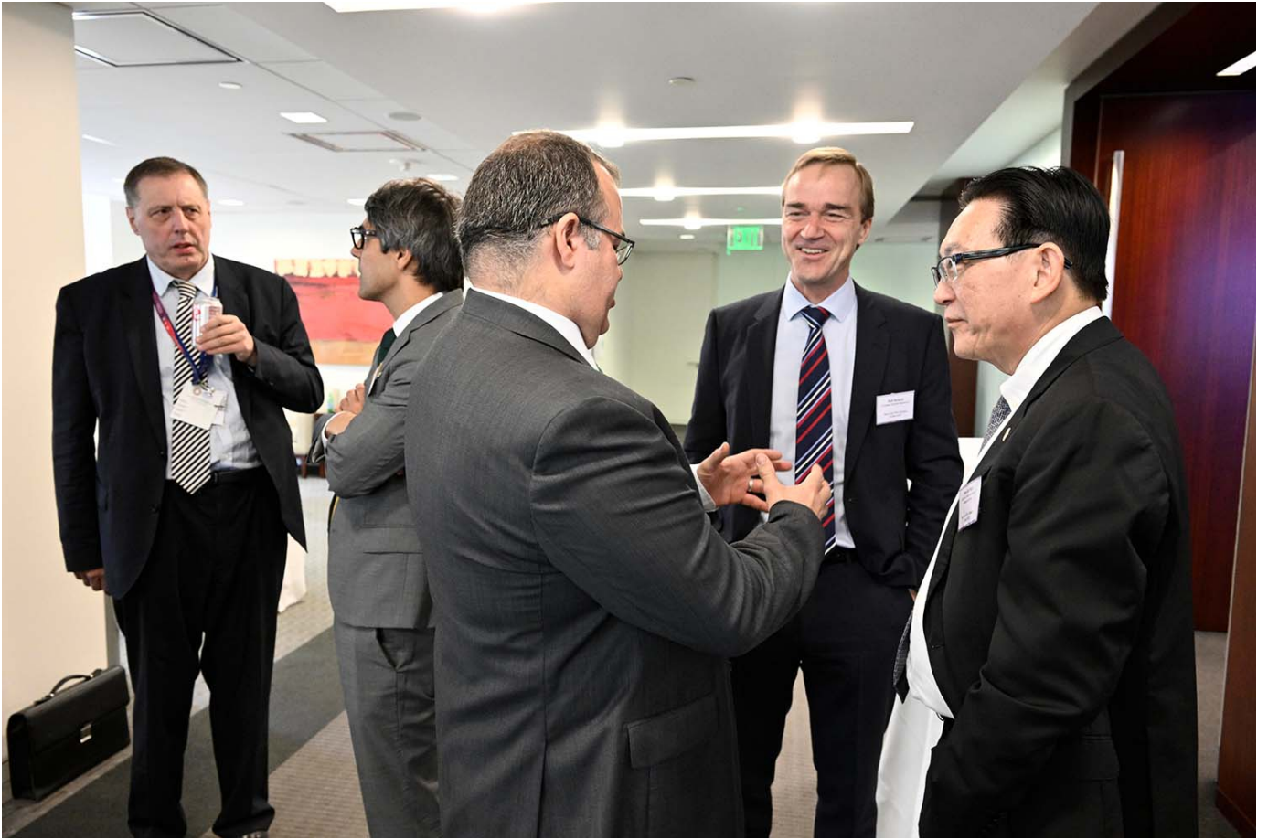
7th High-level RFA Dialogue