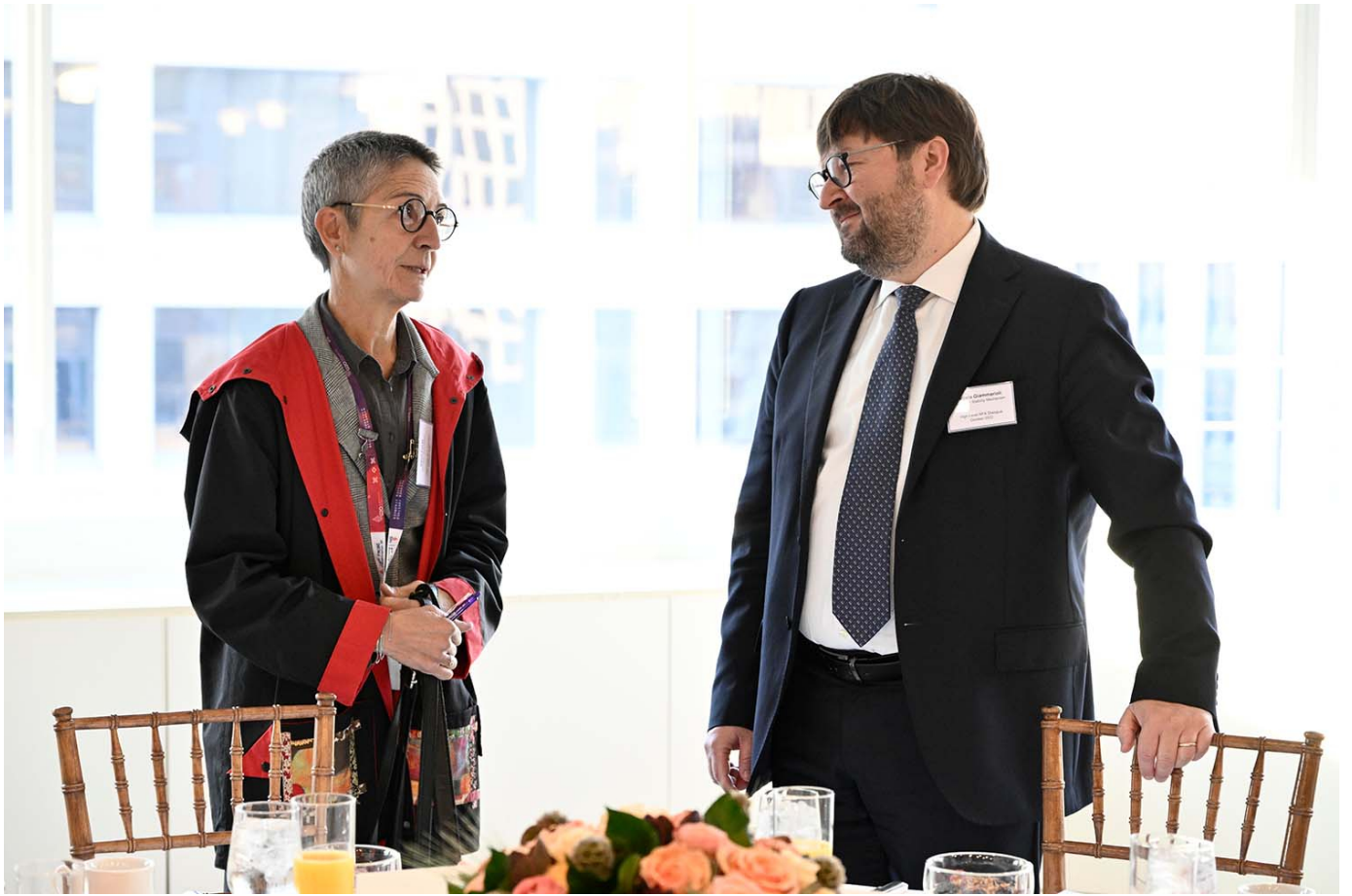
7th High-level RFA Dialogue