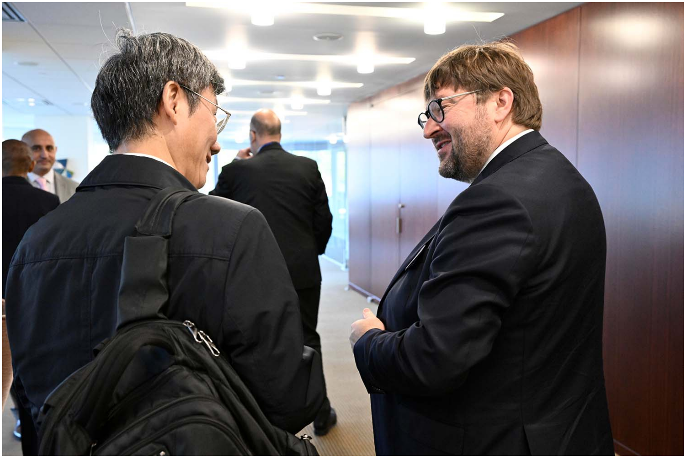
7th High-level RFA Dialogue