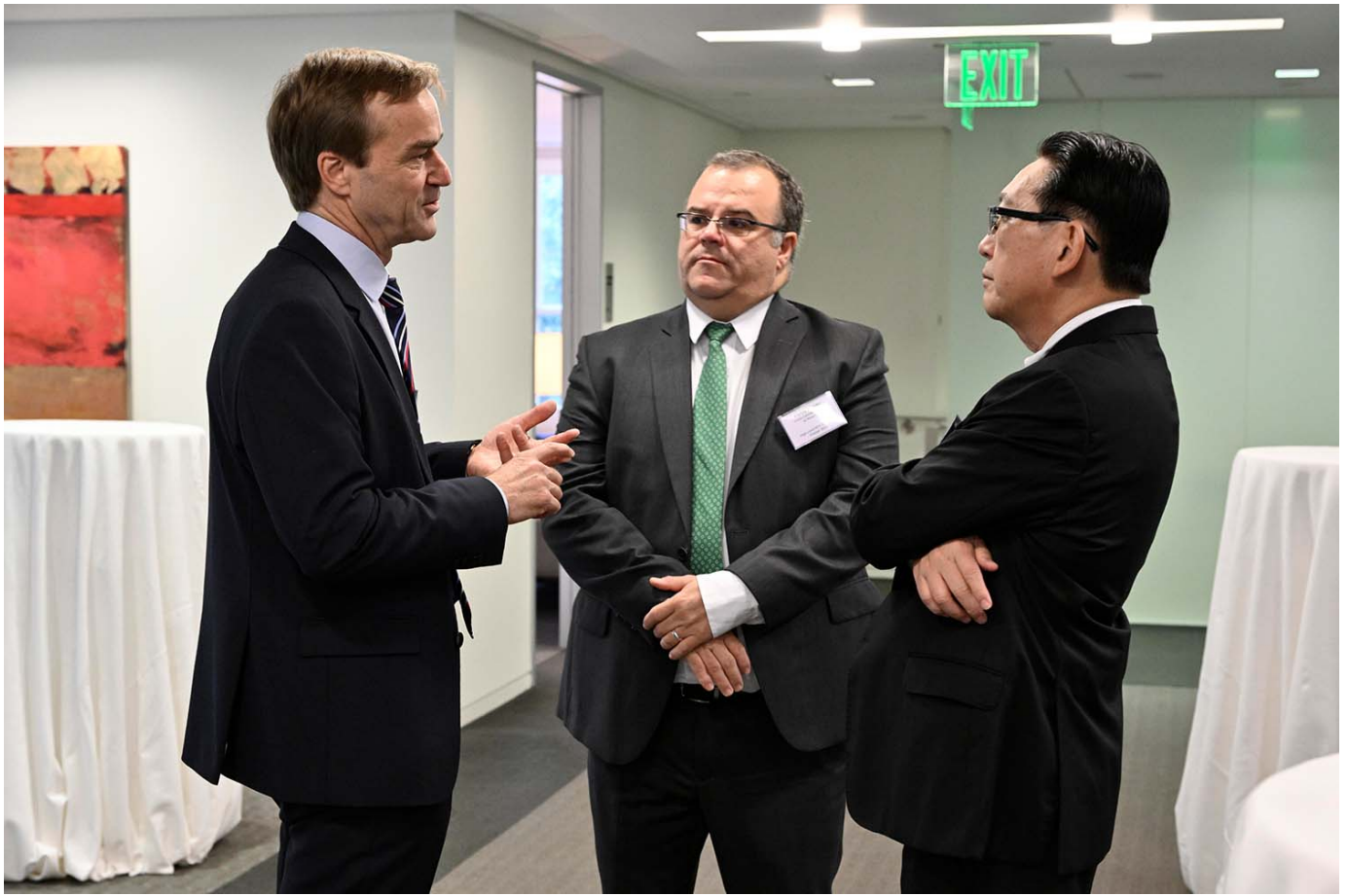
7th High-level RFA Dialogue