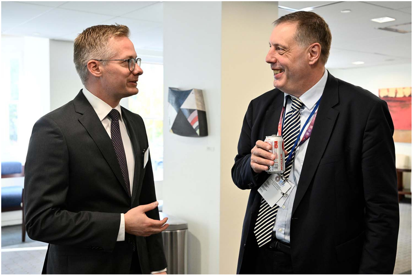
7th High-level RFA Dialogue