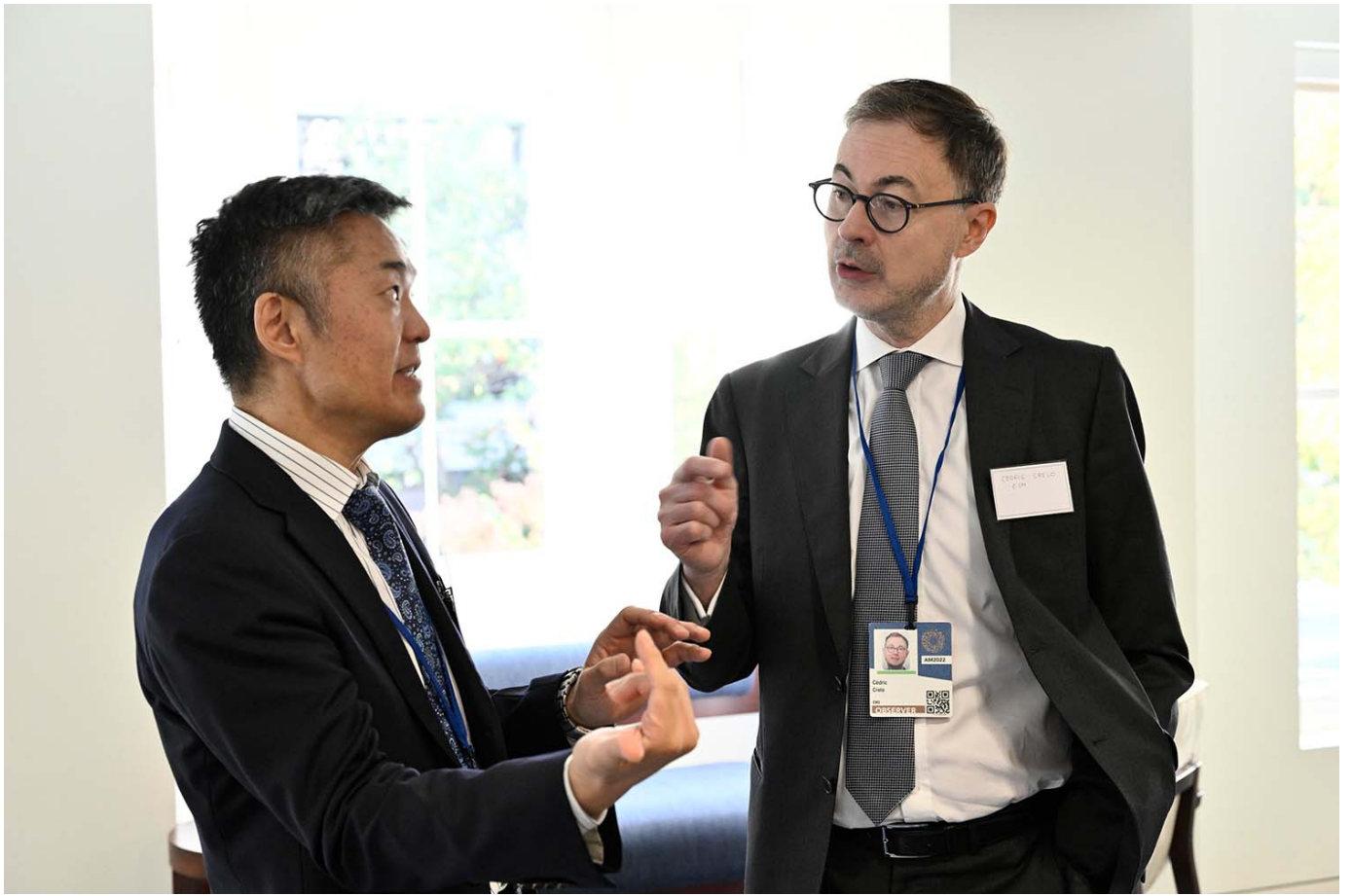
7th High-level RFA Dialogue