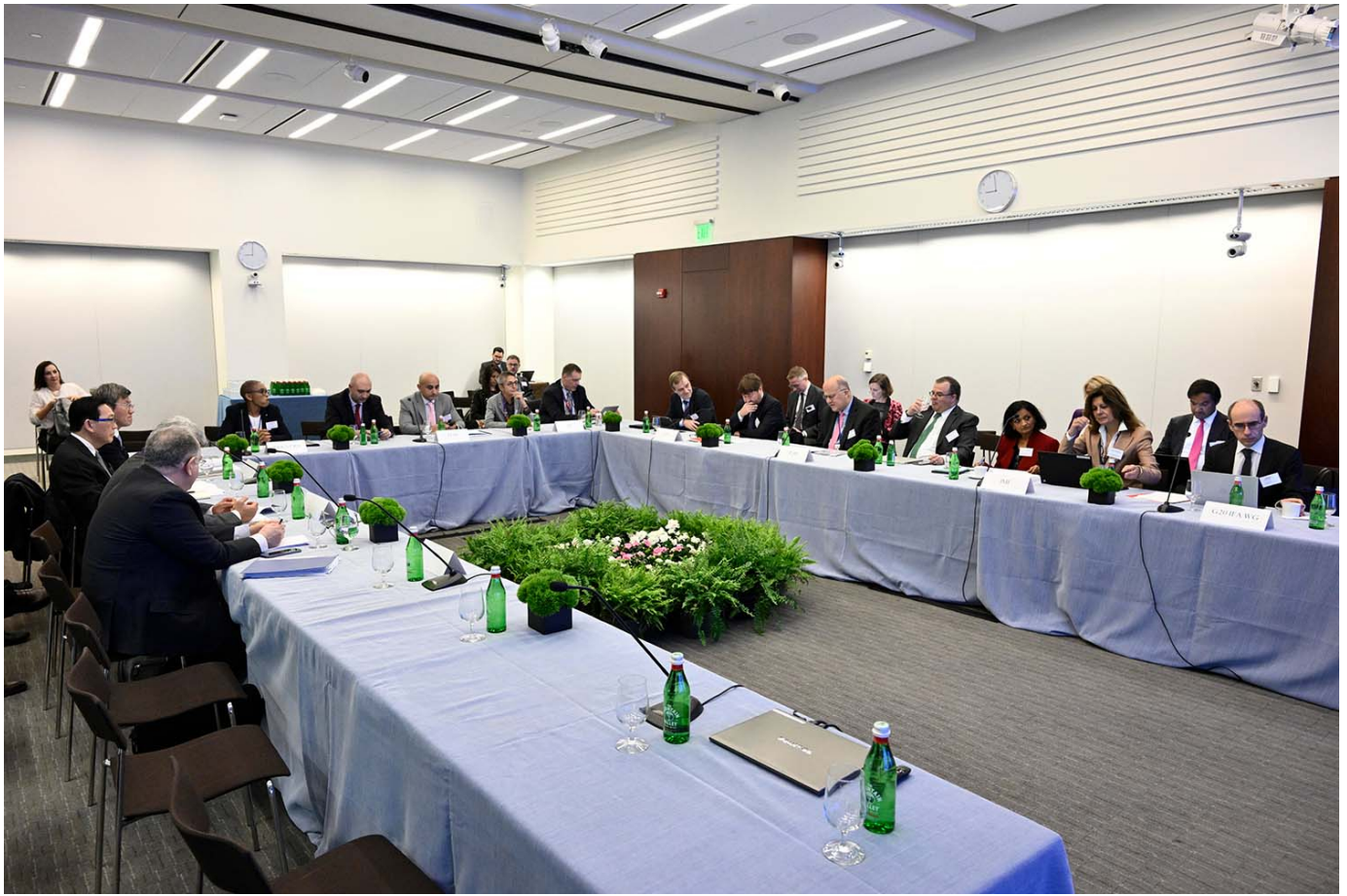
7th High-level RFA Dialogue