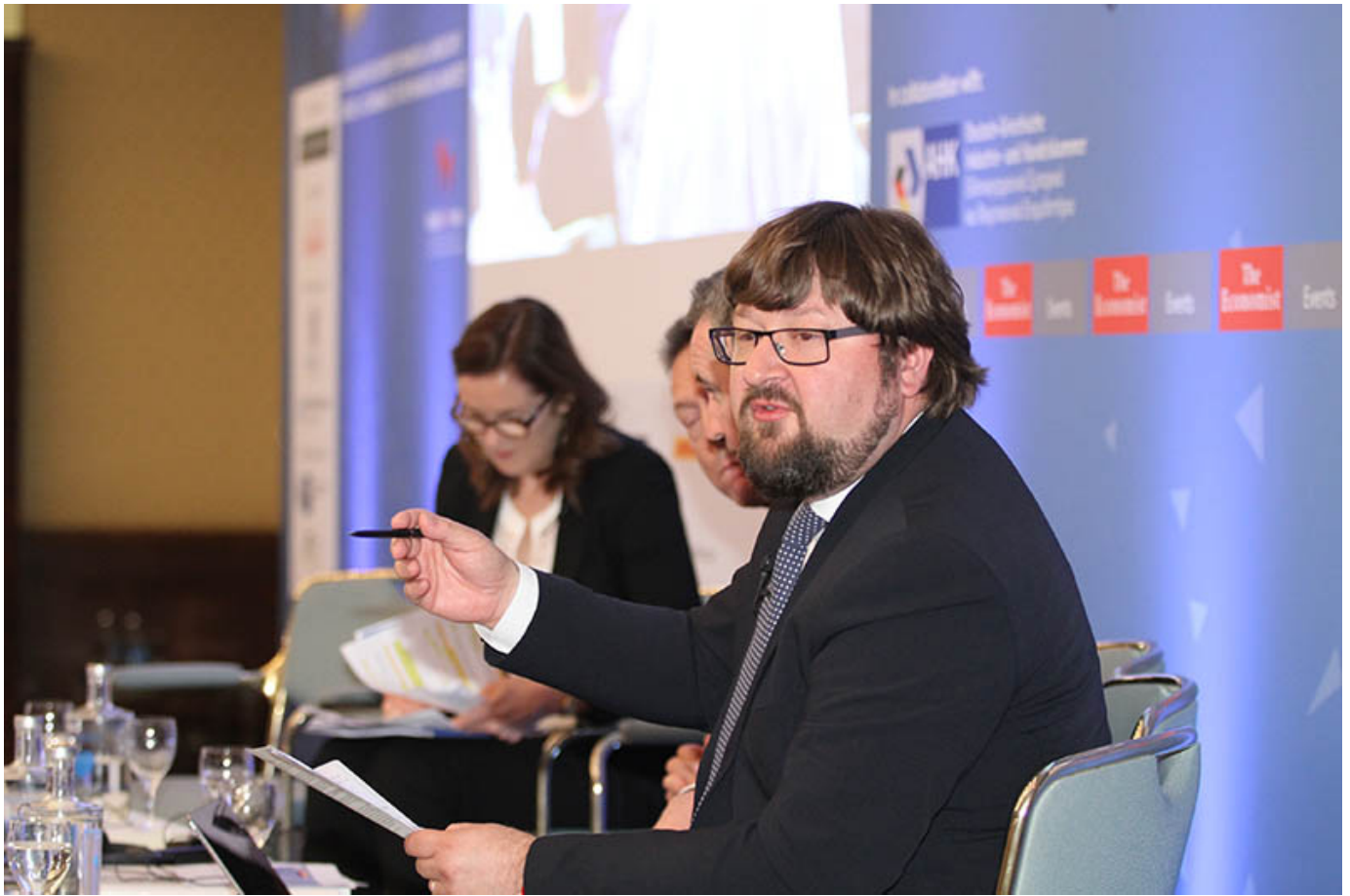
Signing ceremony of the European Financial Stability Facility in June 2010