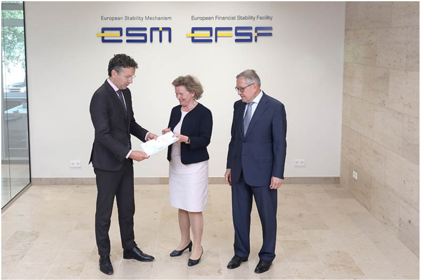
Klaus Regling in cartoon published in Global Capital