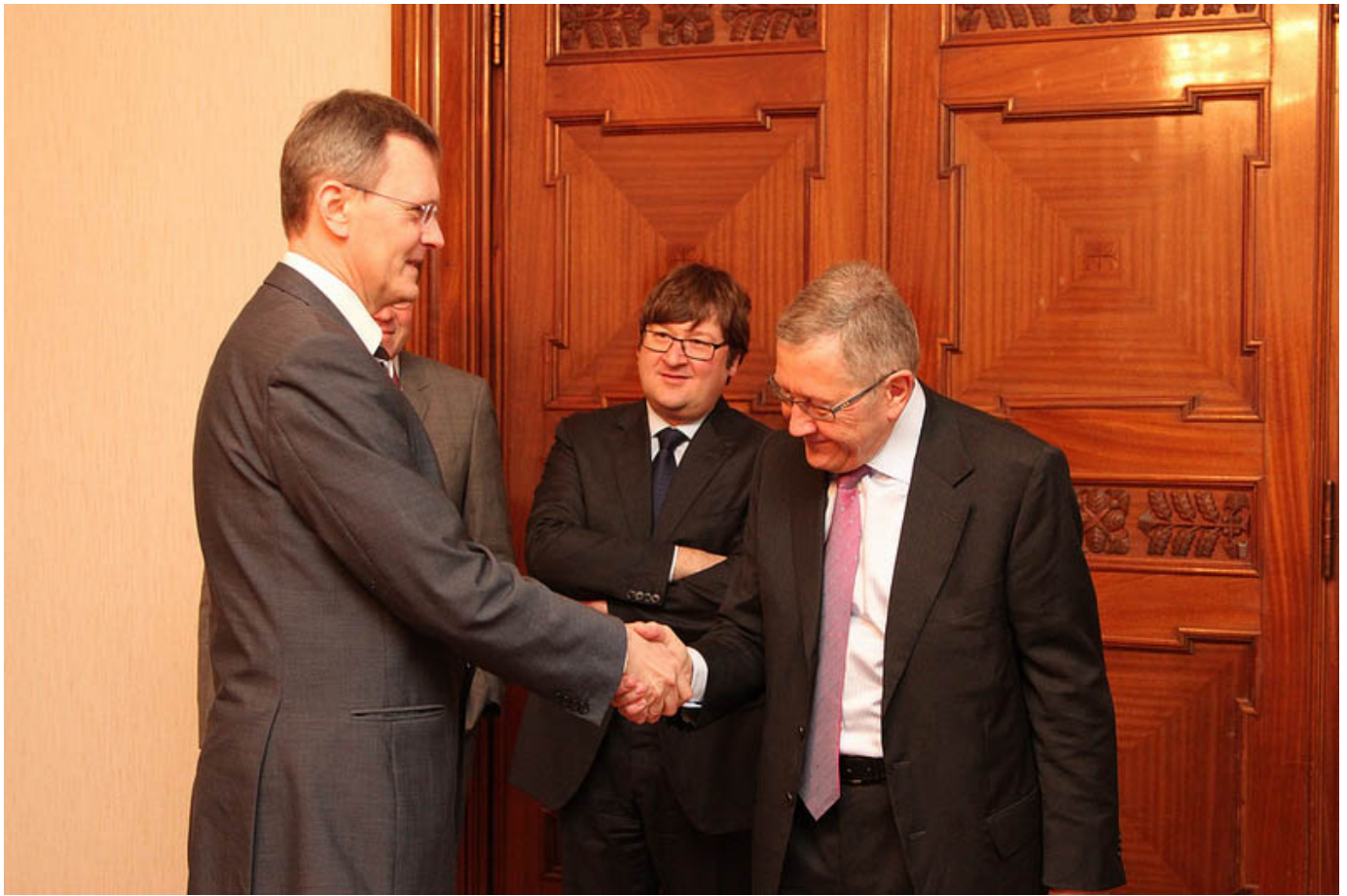
Rimantas Šadžius, Lithuanian finance minister, and Klaus Regling, ESM Managing Director (2014)