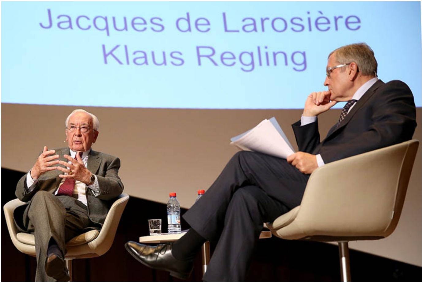
EFSF staff in 2011