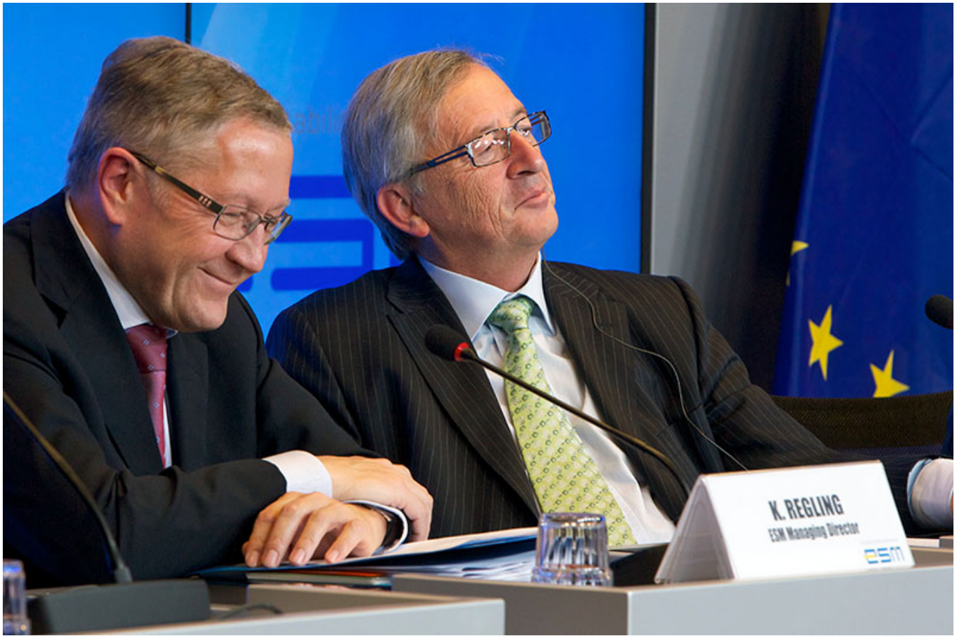
Klaus Regling and Jean-Claude Juncker at inaugural ESM Board of Governors meeting in 2012