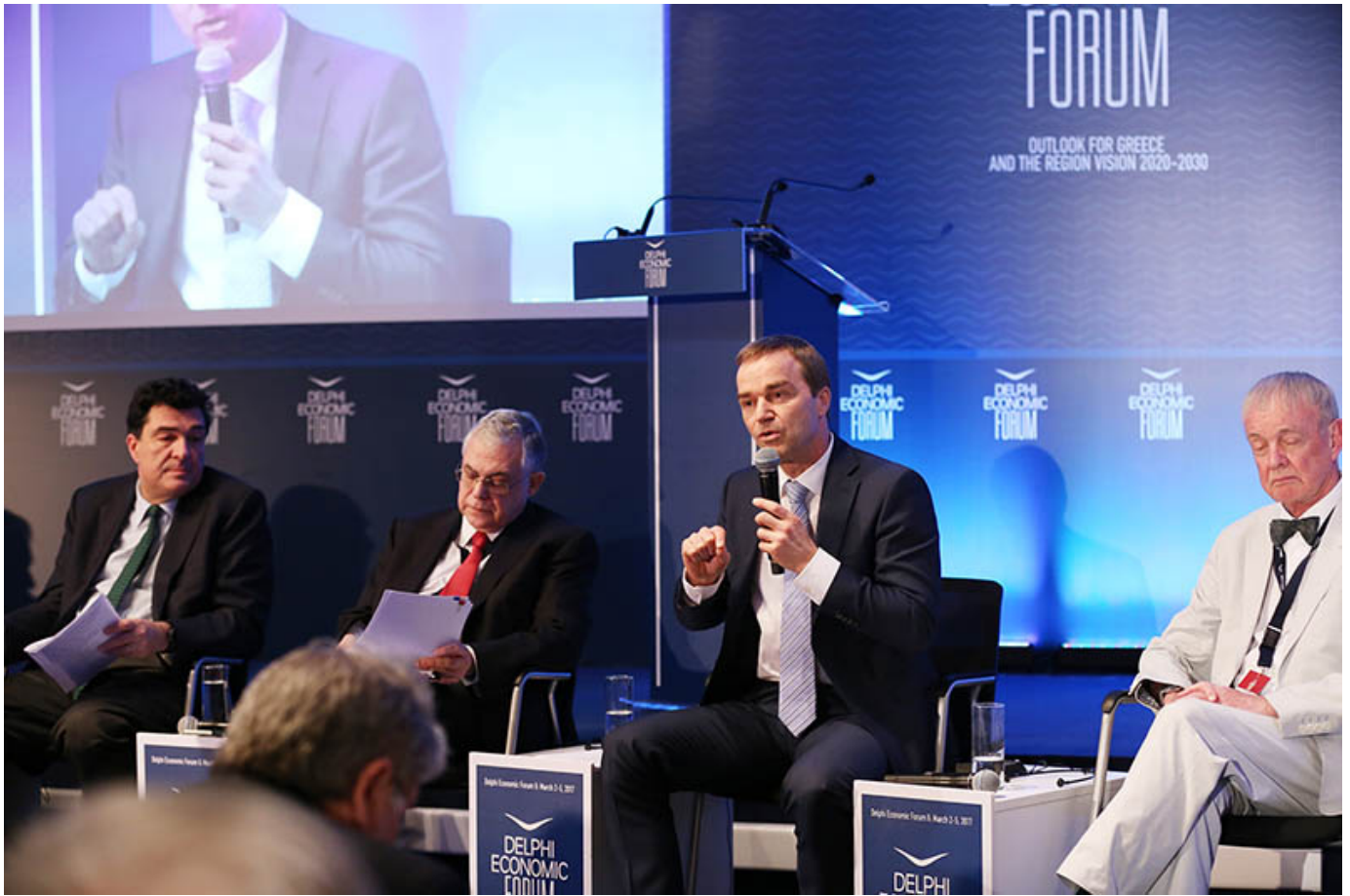
ESM staff at work in the trading room