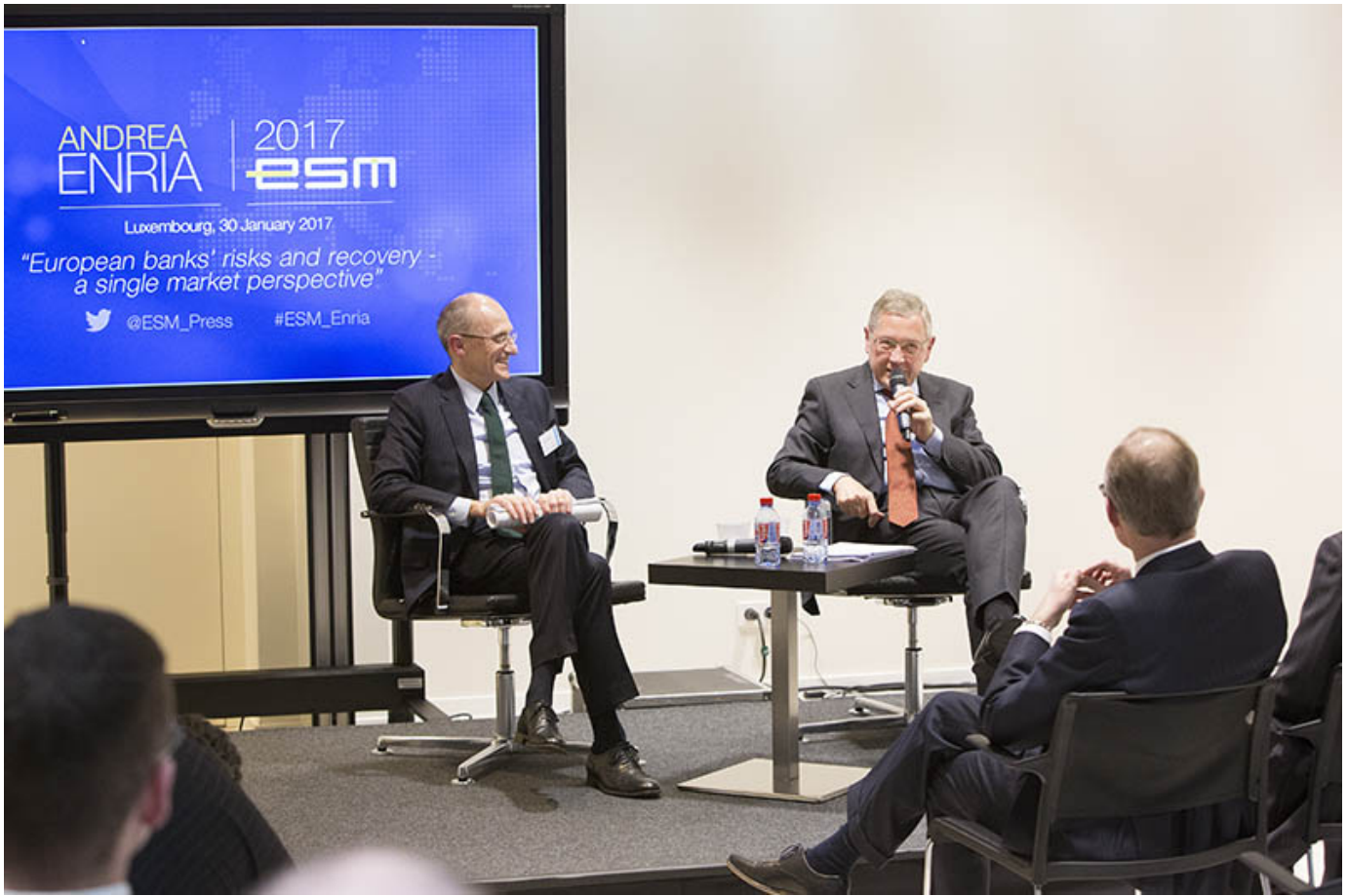
Klaus Regling, ESM Managing Director, and Euclid Tsakalotos, Greek finance minister