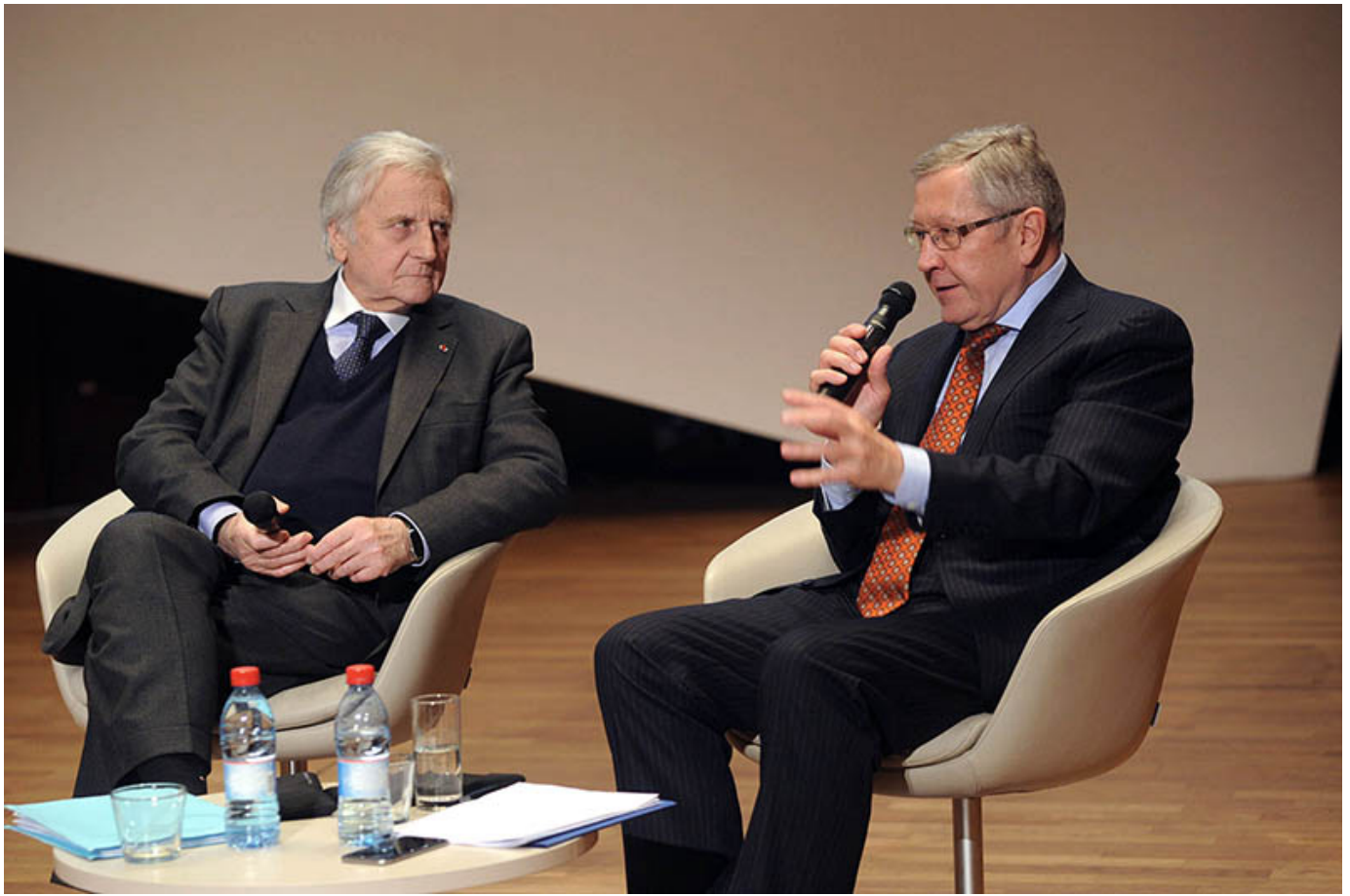
Klaus Regling, ESM Managing Director, and Luis de Guindos, Spanish minister of economy