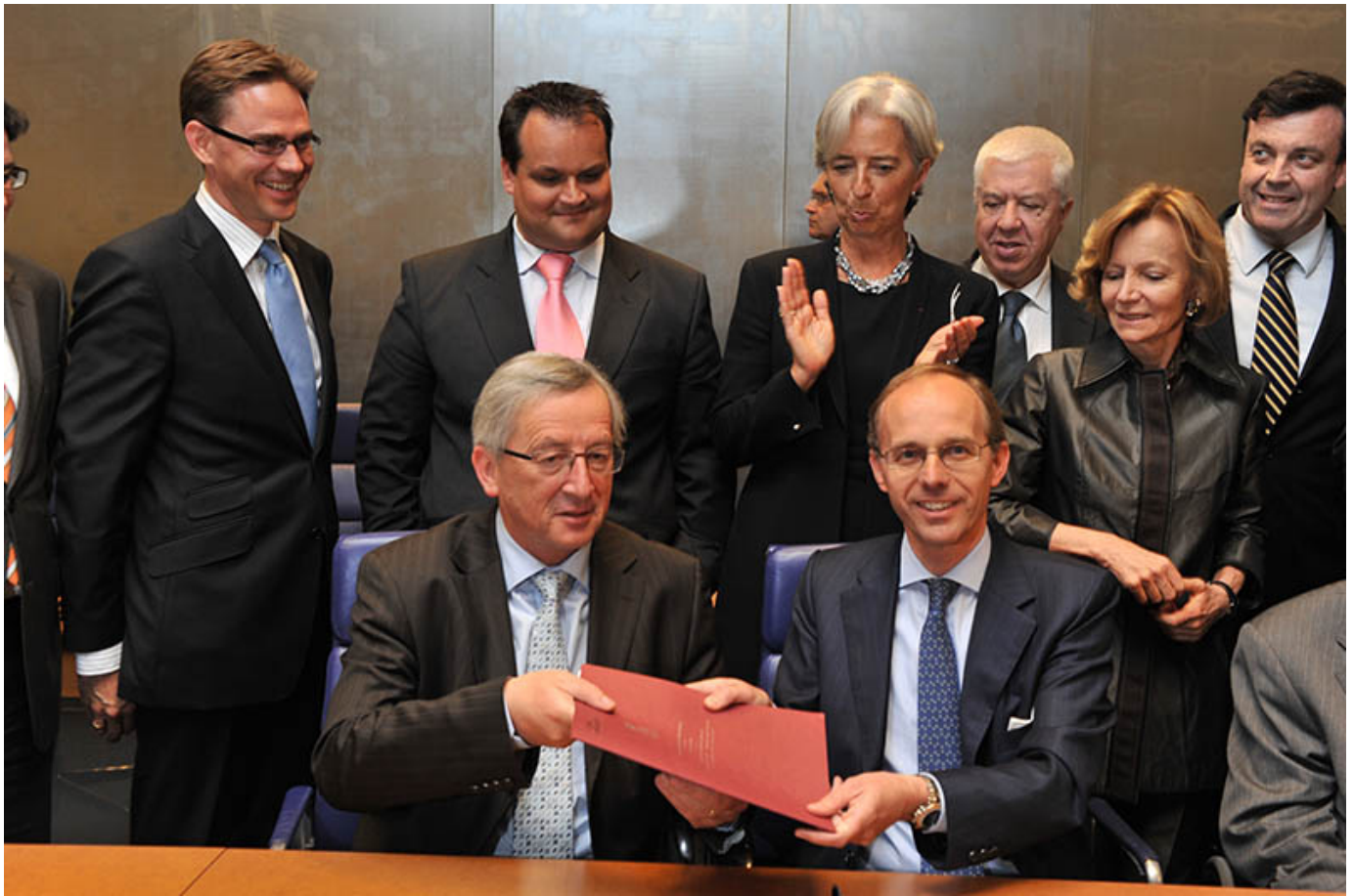
Klaus Regling, ESM Managing Director, Jeroen Dijsselbloem, Chairman of ESM Board of Governors, and Harris Georgiades, Cypriot finance minister