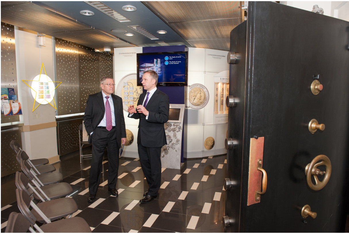
Klaus Regling, ESM Managing Director & Ilmārs Rimševičs, Governor of the Central Bank of Latvia