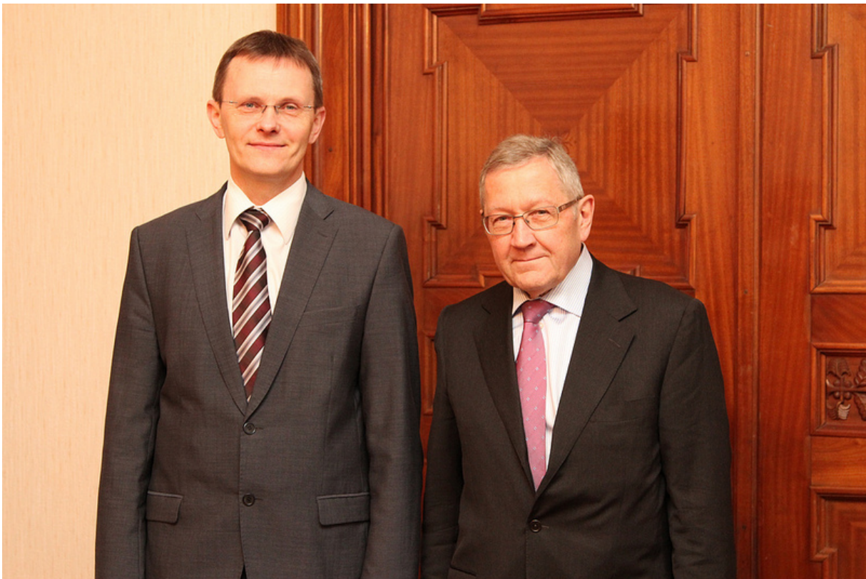
Andris Vilks Latvian Finance Minister & Klaus Regling, ESM Managing Director